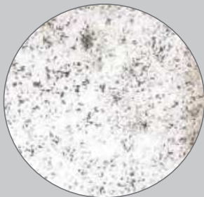
Standard plastic pan with visible mold

Every Healthy Solutions® coil features Microban® technology, providing added protection against the build-up of mold and mildew within your system!