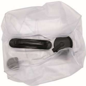
FL1100.01: Jet gun bladder