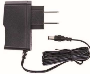
PW1008.01: Battery charger