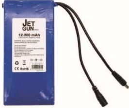
PW1007.01: Extension battery