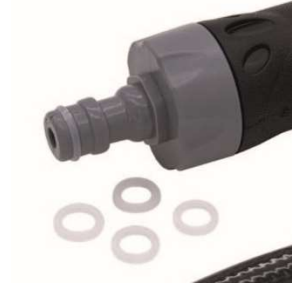
RG9014.05: Gasket for spray gun