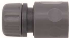
RV6037.01: Female coupler for jet gun hose