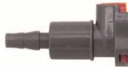
RV6039.01: Female coupler for bag connection