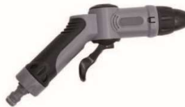
RP1067.01: Nozzle for spray gun