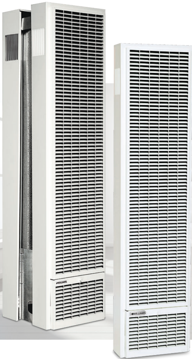
DUAL-WALL TOP-VENT 50,000 BTU/hr.