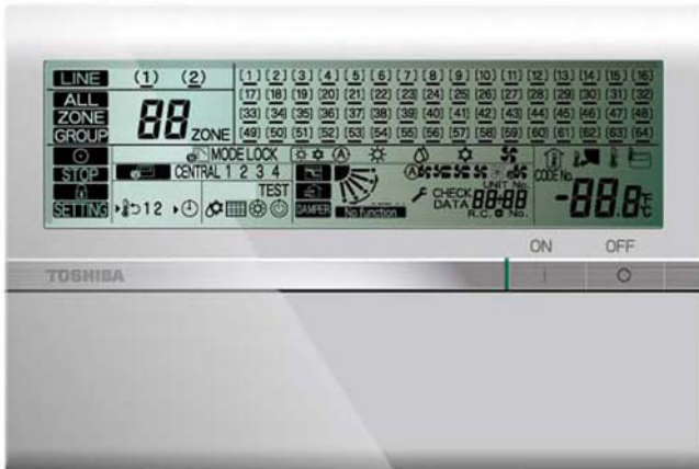
MAX 128 INDOOR UNITS PER SMART MANAGER (2 TCC links with 64 units each)

Job Data _____ Location _____ Buyer _____ Buyer PO # _____ Carrier # _____ Unit Number _____ Model Number _____ Performance Data Certified By _____ Date _____