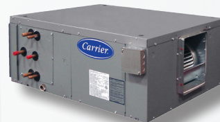
Constant Volume AHU