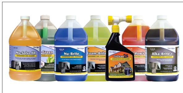
CONDENSER COIL CLEANERS