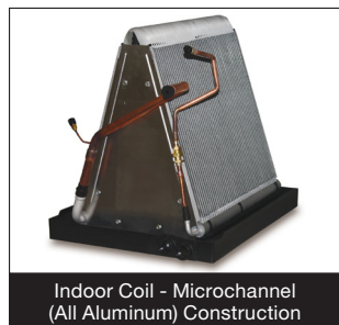
Indoor Coil - Microchannel (All Aluminum) Construction