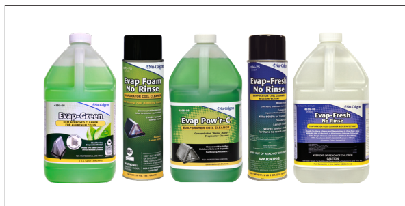
EVAPORATOR COIL CLEANERS