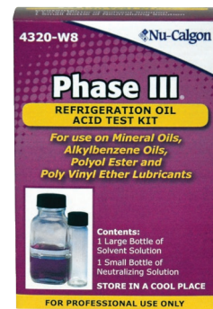
PART NUMBER: 4320-W8

In addressing this situation, the technician's refrigeration oil acid test kit has become indispensable, and Nu-Calgon's Phase III® Refrigeration Oil Acid Test Kit is the most reliable test kit available.