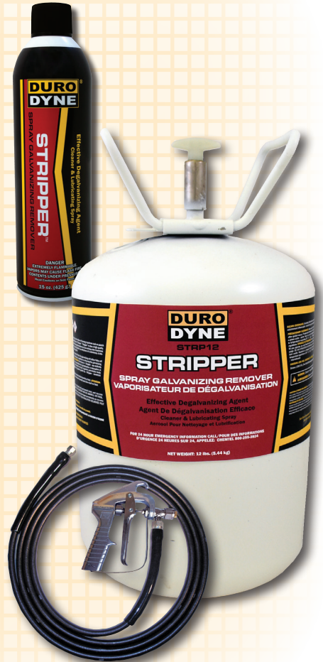
Hoses, Gun & Gun Tips sold separately

The convenient 12 pound canister has a precise, powerful, long spray pattern. This makes it the best choice to safely get to the tightest roll formers and die sets in sheet metal shops, without the danger of getting too close to the rollers. This innovative, dynamic option eliminates the need for cumbersome individual cans and is great for larger shops.